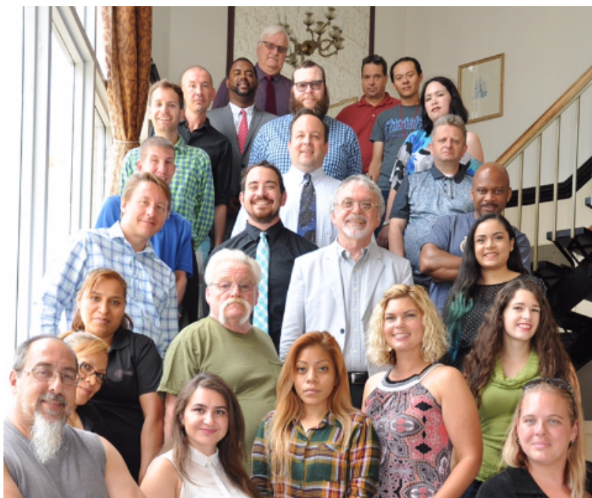
~ WIA Staff